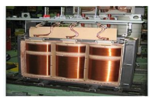
Fig.3 Amorphous metal transformer

Most of the literatures about smart grid discuss these latest technologies in the beginning. These technologies are certainly very important for realizing the benefits of smart grid. But, starting with these latest technologies, those references do not touch many small and peripheral issues discussed in Sections 3 and 4. Therefore, the author has purposely taken up these discussions now.