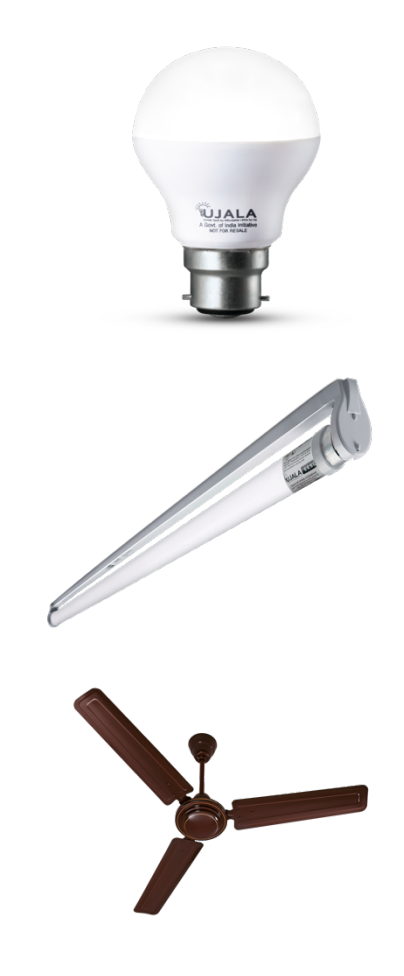
Fig.1 LED bulb & tube-light and energy-efficient fan under UJALA scheme of GoI

In 2015, GoI launched the "Unnat Jyoti by Affordable LEDs for All" (UJALA) scheme [13]. In a short span of 4 years, this Indian scheme has emerged as the world's largest domestic lighting program. Developed to address India's high cost of electrification and use of inefficient lighting devices by the consumers in the past, UJALA's success lies in its inimitable strategic approach to energy efficiency. Under the scheme, millions of LED bulbs and a few hundred thousand of LED tube-lights and energy-efficient fans have been distributed to people all over India at very low prices through various Public Sector Undertakings, Post Offices and other organizations (Fig.1).