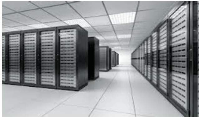
Fig.7 Stationary battery energy storage system

made power distribution engineers to think about application of battery banks in smart grid. 2018 was a remarkable year for the stationary energy storage (Fig.7).