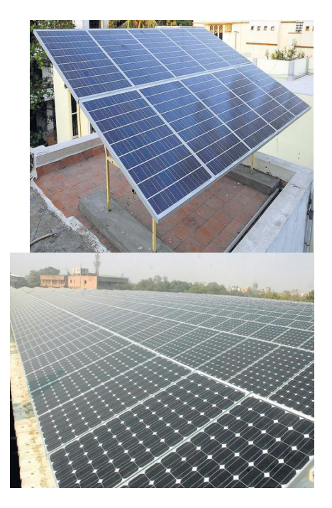
Fig.6 Solar PV on rooftop and in open space (as distributed generation)

The benefits of this "DisGen" can be summarized as follows.