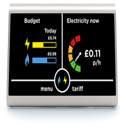
Fig.4 Smart meter

In fact, "Smart Meter" (Fig.4) is a key component of smart grid [17]–[18]. A few essential features of a smart meter are discussed below.